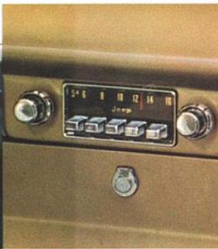
Push Button Radio