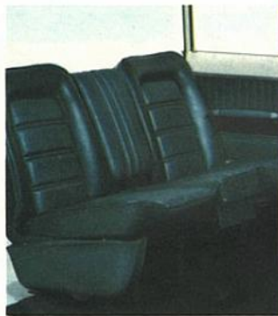
Plush Bucket Seats