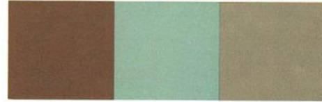
Burnished Bronze Island Blue Vintage Gold