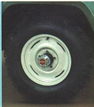
Selective Drive Hubs