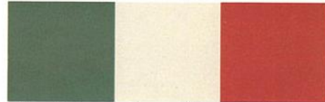
Sprucetip Green Champagne White President Red